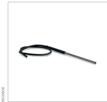
Gas probe stainless steel

Incl. mounting cone, 0.7 m hose (up to 200 °C)