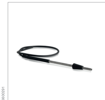
Gas probe Al

Incl. mounting cone, 0.7 m hose (up to 200 °C)