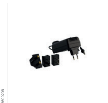
Plug-in charger, 100 V - 240 V